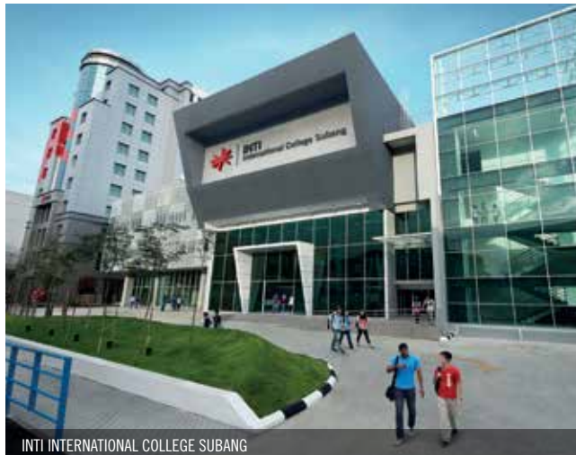
INTI INTERNATIONAL COLLEGE SUBANG