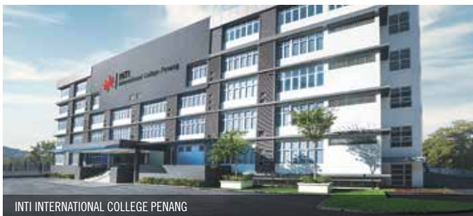
INTI INTERNATIONAL COLLEGE PENANG