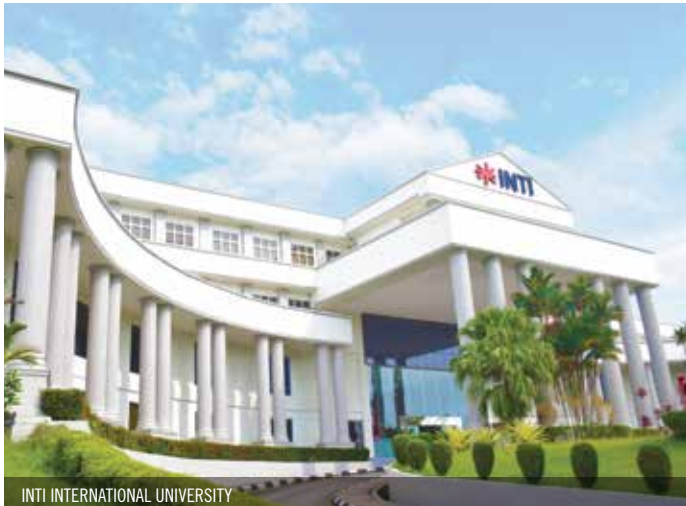
INTI INTERNATIONAL UNIVERSITY